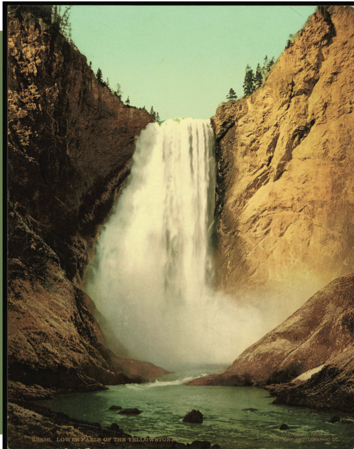
Brigham Young University Harold B. Lee Library L. Tom Perry Special Collections; MSS 1608

The BYU Library is proud to support the 2023 Inter-Mountain Archivists Annual Conference